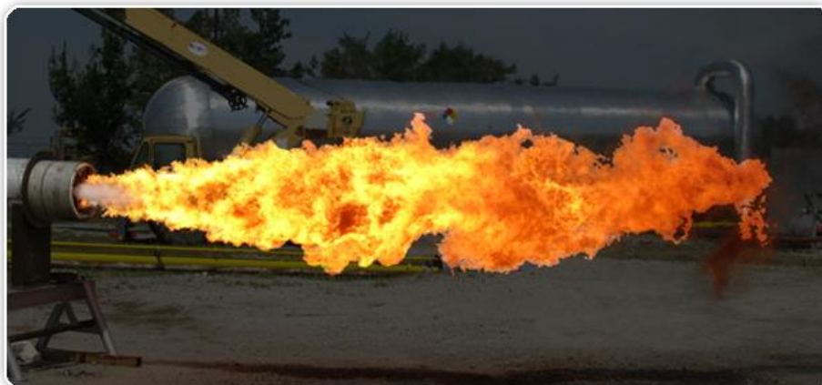
Plate 1: A Horizontal Flaring