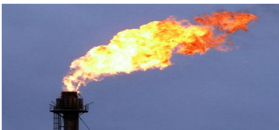
Plate 2: A Vertical Flaring